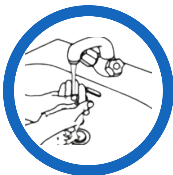
Rinse under running water

Particularly between fingers, fingertips, back of hands and base of thumbs.