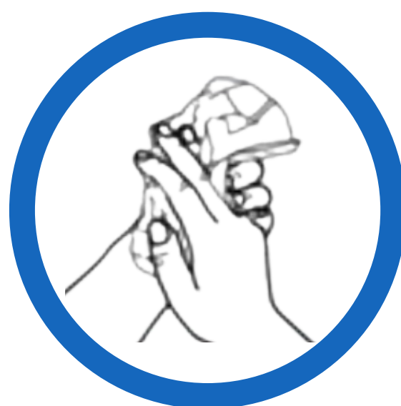
Pat hands dry with disposable paper towel